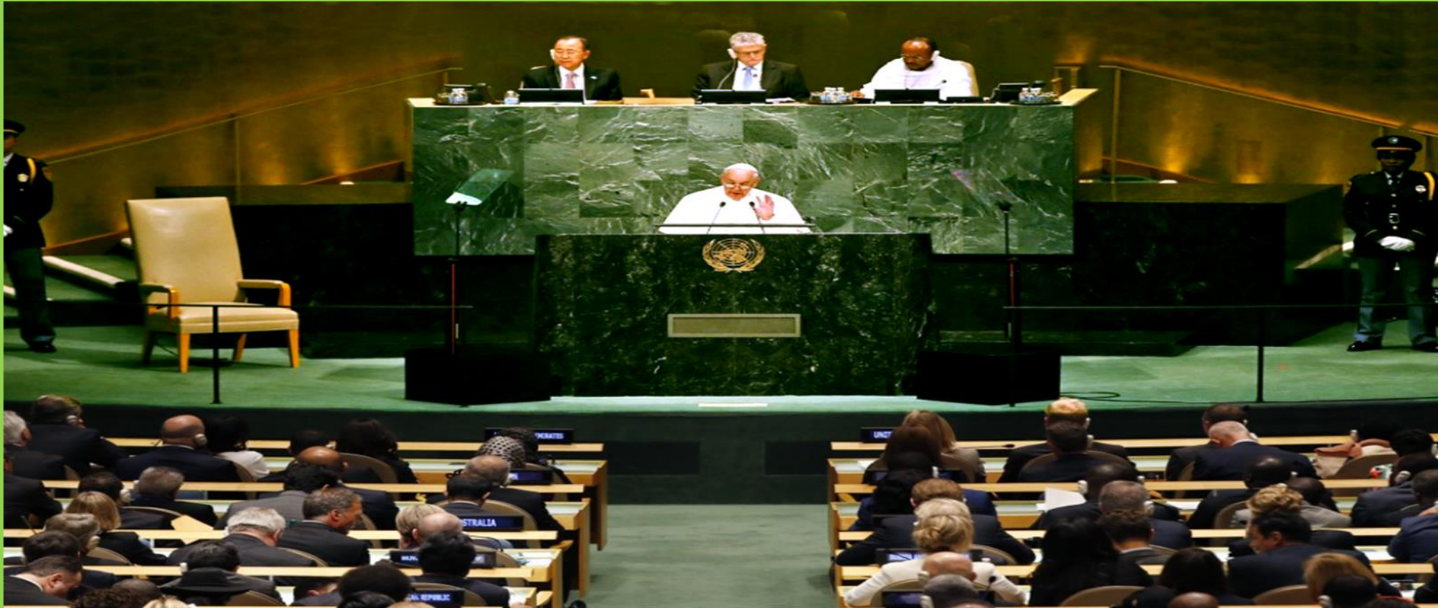
Pope Francis addresses a plenary meeting of the United Nations Sustainable Development Summit 2015 at United Nations headquarters in Manhattan, New York, Sept. 25.