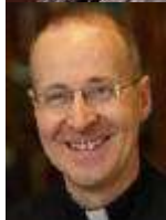
Fr. James Martin, SJ

Language: English Topic(s): Media & Young Adult Ministry