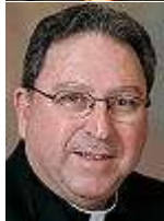
Rev. Allan Figueroa Deck, SJ

Language: Spanish Topic(s): Adult Education